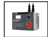
High frequency carrier technology to make the fan start smoothly and run noiselessly