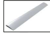
Aircraft grade aluminum