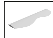
Aircraft grade aluminum