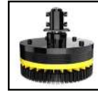
Permanent magnet synchronous brushless direct drive motor