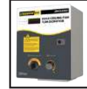
High frequency carrier technology to make the fan start smoothly and run noiselessly